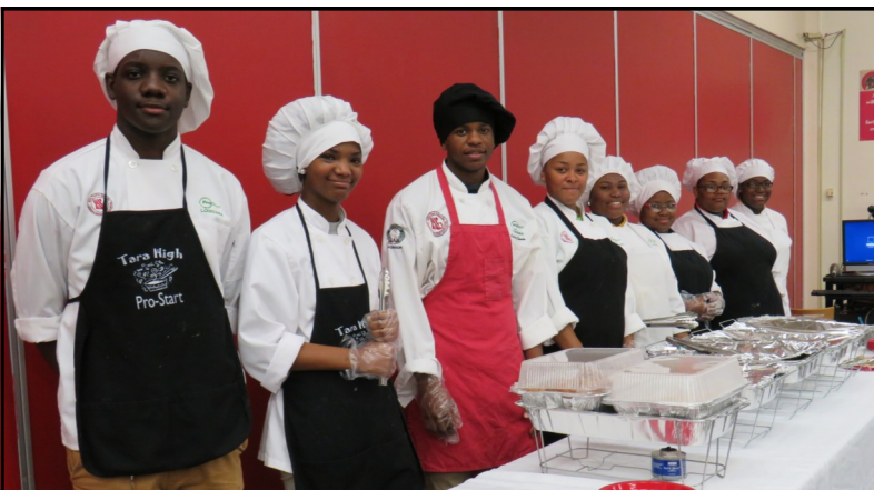
Picture below: Tara High School students in the school's ProStart Program served the Board a delicious lunch.